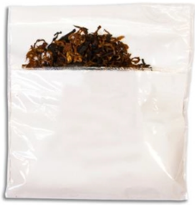
Pipe and Pipe Tobacco